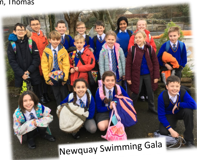
Newquay Swimming Gala