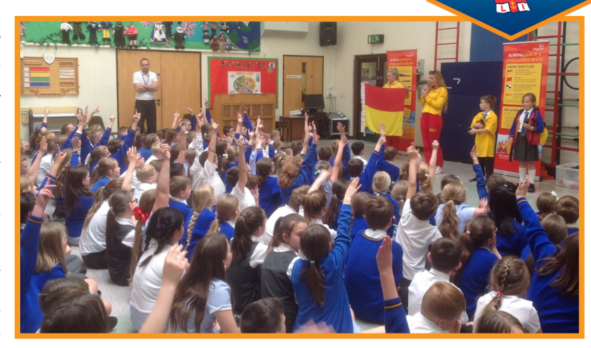
Y3 reporters: Sid, Erin and Zak.

and life jackets to get you out. You are always safe because the RNLI are always there when you need them most, but you must still be careful!