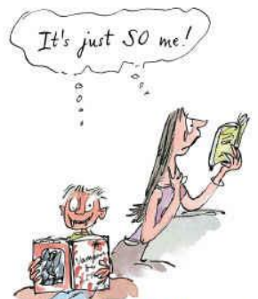
6 The right to mistake a book for real life.