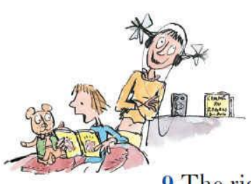
9 The right to read out loud.