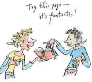
8 The right to dip in.